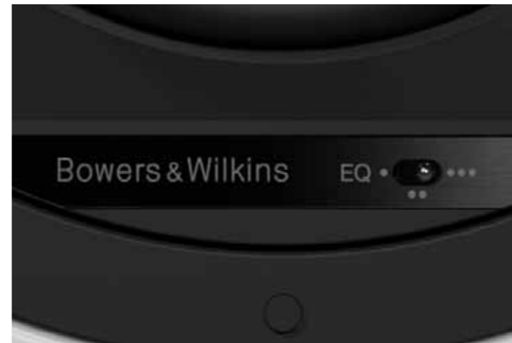
Equalisation for improved listening experience

Almost all of the tweeters in the range can be positioned in a variety of angles. However this only solves half the problem in focussing the sound to the required area of the room.